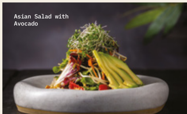
Asian Salad with Avocado