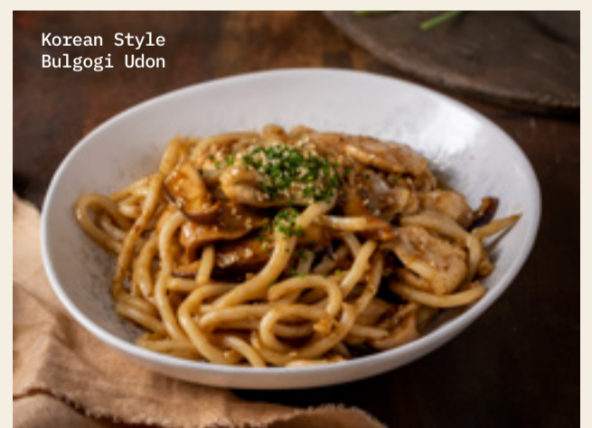
Korean Style Bulgogi Udon