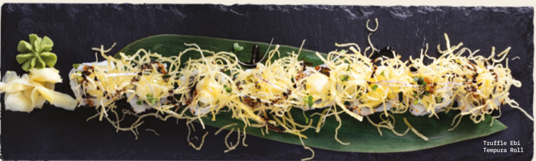
Truffle Ebi Tempura Roll