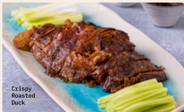
Crispy Roasted Duck